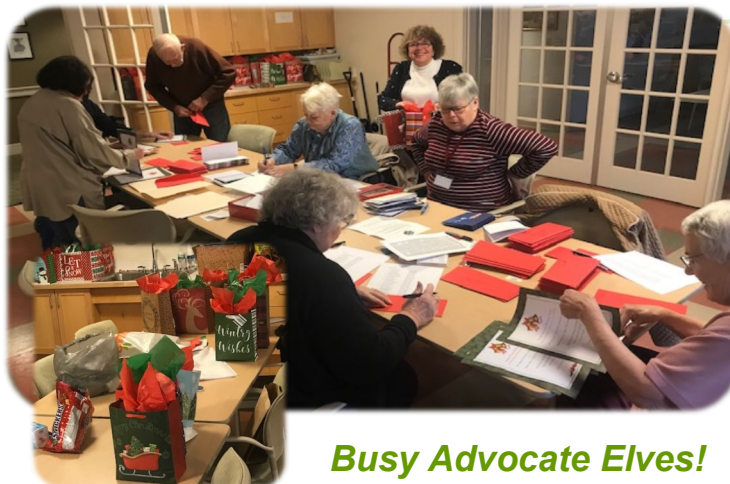
Busy Advocate Elves!

Red Cross issues urgent call for donations: Right now, blood products are being distributed to hospitals faster than donations are coming in.