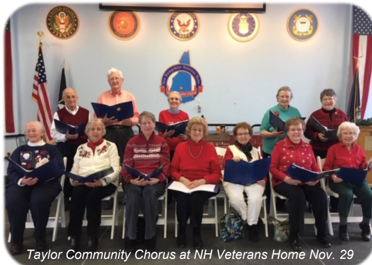
Taylor Community Chorus at NH Veterans Home Nov. 29

Scatter seeds of kindness wherever you go