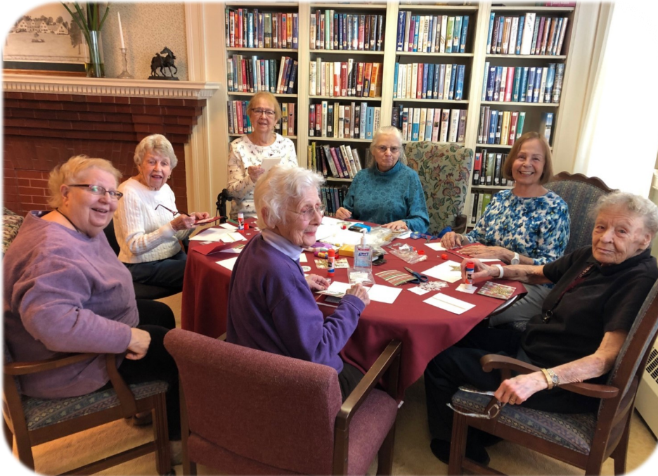
Card-Making Merriment with Taylor Home Friends!