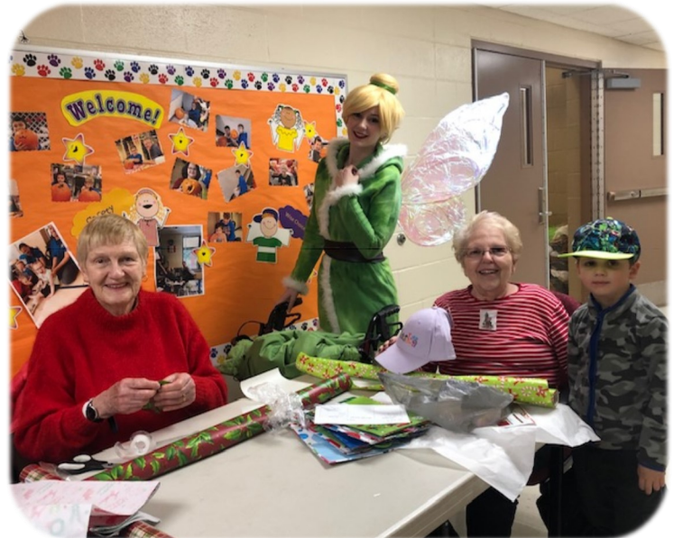
Residents help Elm Street Students wrap their gifts at the Presents for Elm event December 1.