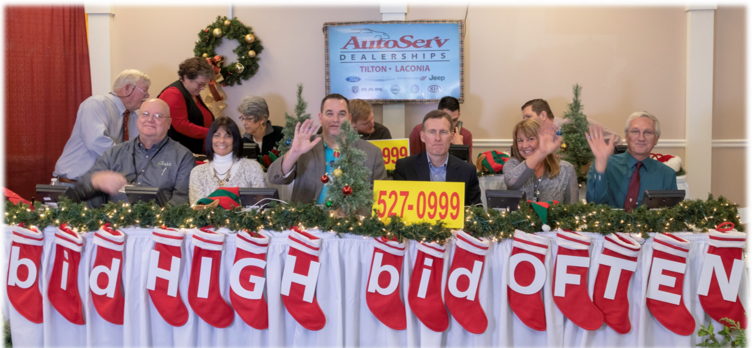
Team Taylor hard at work at the WLNH Children's Auction... GO TEAM TAYLOR!!!