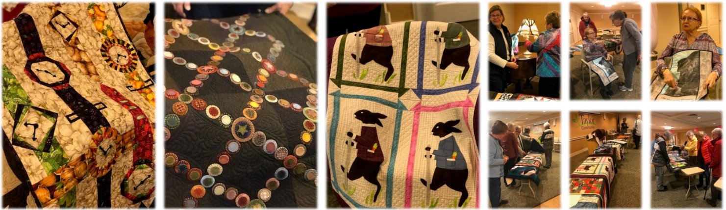
Members of Stitch Witchery Quilters Guild and Sew Sisters joined together to present their work, share experiences and answer questions November 19 at Woodside. Such talent!