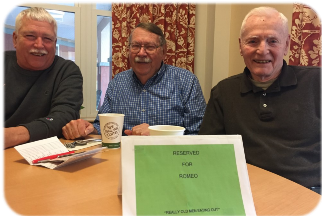
Can you read the fine print? It says, "Reserved for ROMEO." Really Old Men Eating Out. Hahaha!