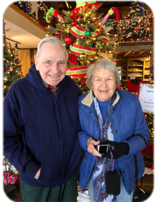
Best Holiday Smiles!